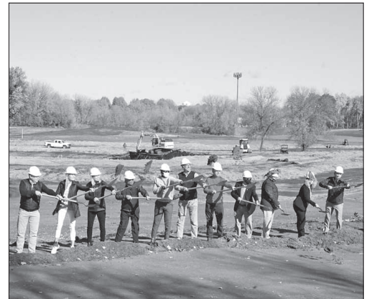
Officials dig in during a groundbreaking Oct. 13 for The Loop at Chaska.